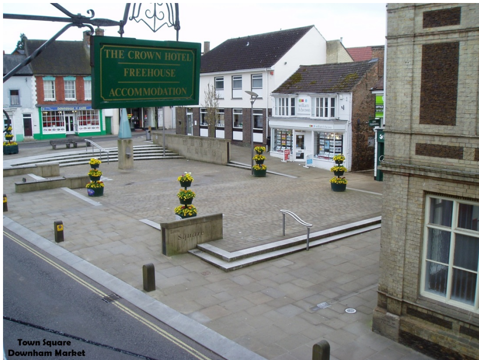
Downham Market Town Square 2011 taken from our hotel room