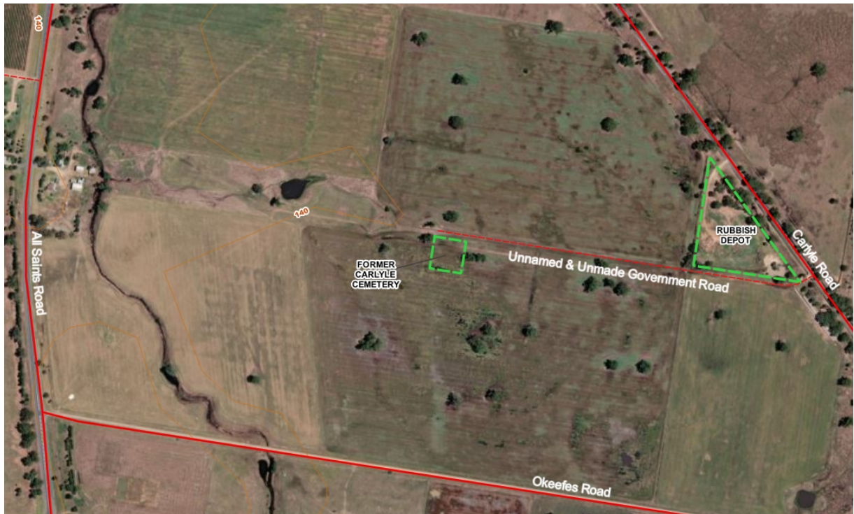
Fig 5. Satellite Image