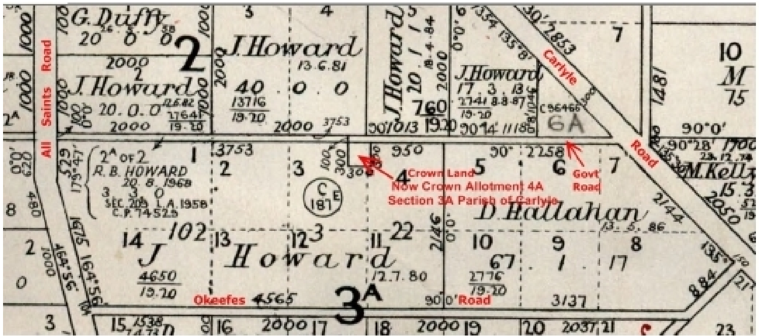
Fig 1. Parish of Carlyle C 187(8) Sheet 1